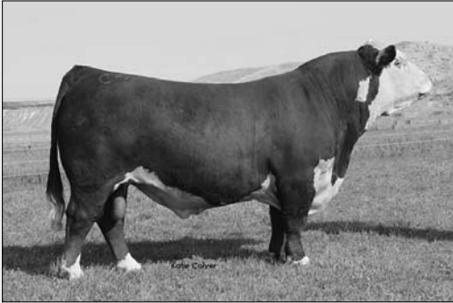
C DOUBLE YOUR MILES 6077 ET