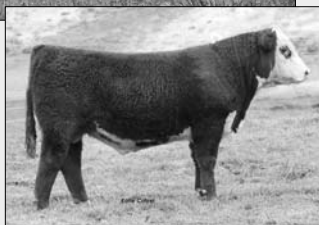
SON ... C 8105 GENESIS 1024 ET