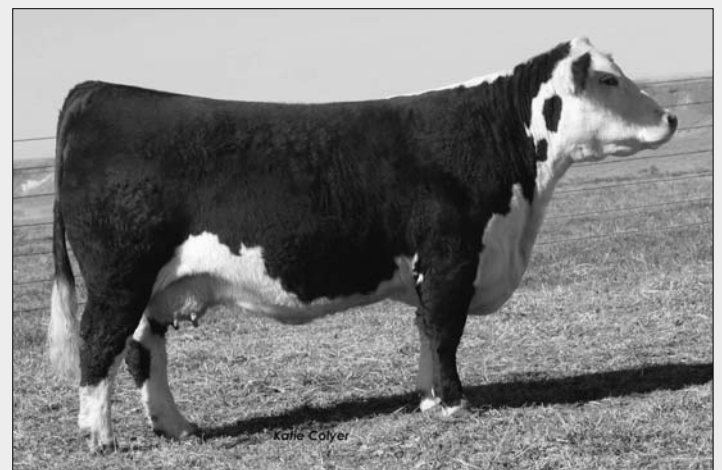
DONOR DAM ... KLD MELANIA D76 ET