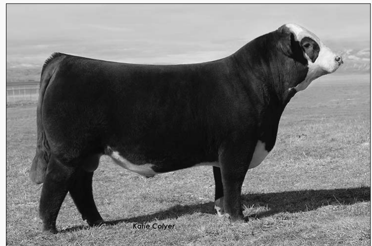
C ARLO 2135 ET