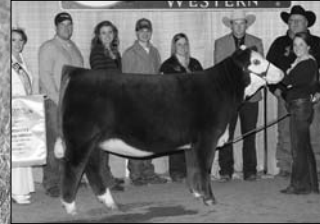
DONOR DAM ... GGSC CARLEE 6B