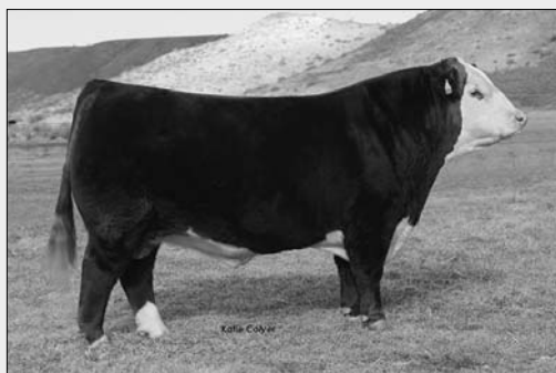
C KEY WEST 0065