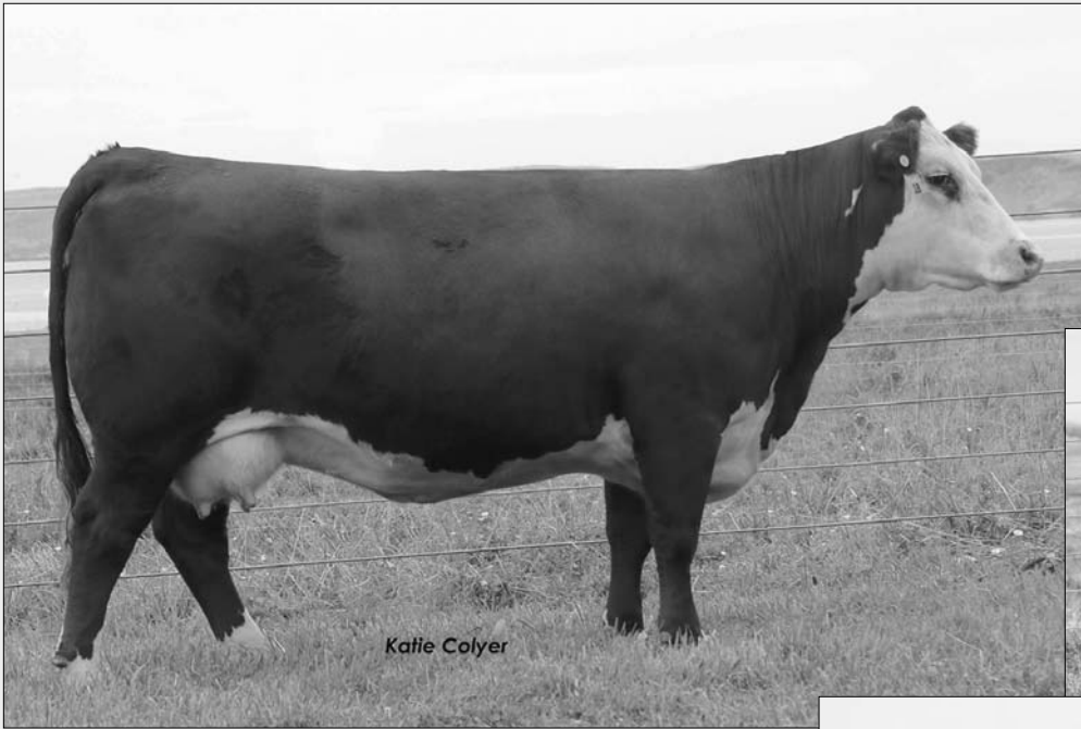
DONOR DAM ... C 1008 MILKY WAY 6133 ET