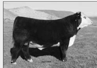
SON ... C CJC 4264 ADVANCE 3125 ET