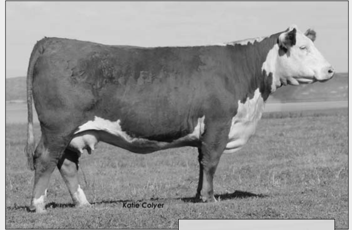
DONOR DAM ... BR BAILEE 1066 ET