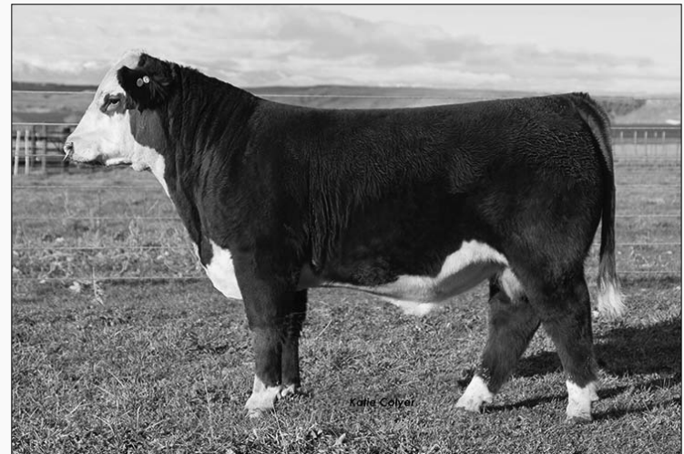
C REIGN MAKER 3210 ET