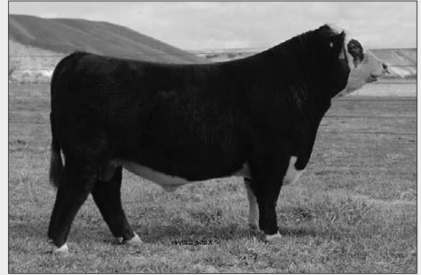
SIRE OF MATING ... C DENALI HD 2105 ET