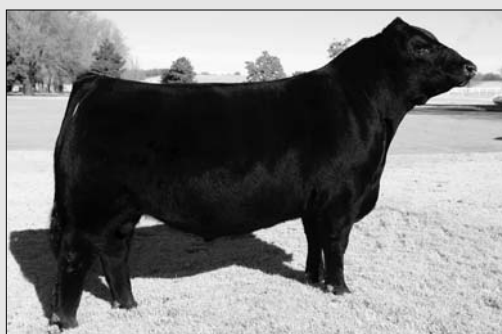
BC II SKYFALL 2812