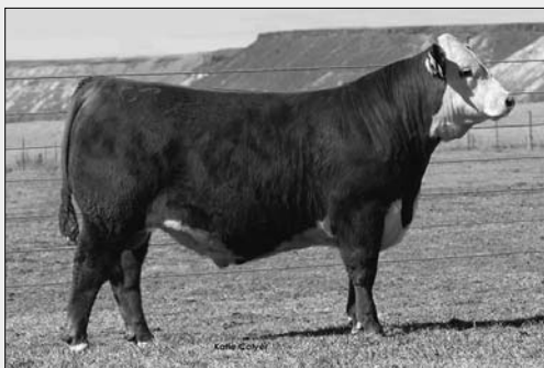
C CJC 4264/4013/0195