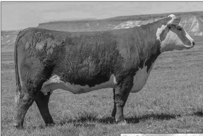
DONOR DAM ... C BAR1 BAILEES DOUBLE MILES ET