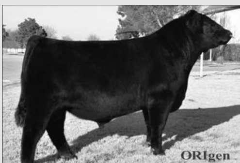
EXAR BLUE CHIP 1877B