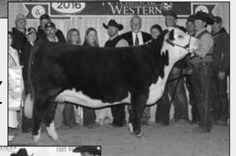
DAUGHTER ... C CANDY CANE 4030 ET