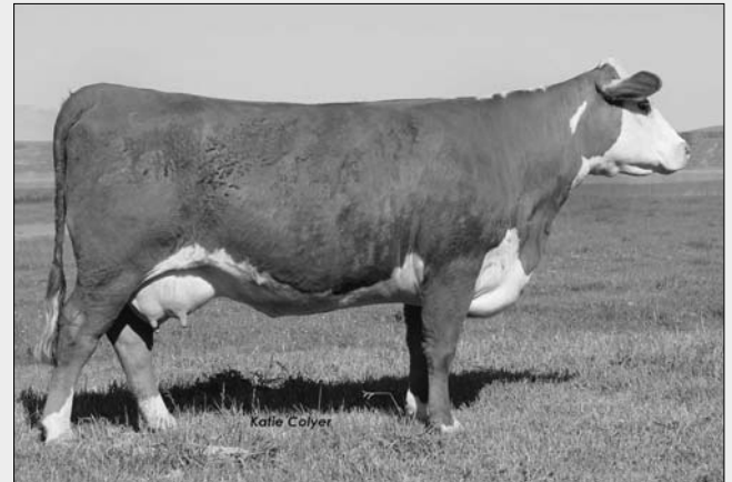
DONOR DAM ... GRANDVIEW CMR MISS VIC X178

X178 was the choice of 4003 daughters in the same dispersal, and she possessed great femininity, extreme body length and was a heavy milker. A great producer, she had progeny ratios of 5@110 for WW, 3@104 for YW and 9@105 for REA.