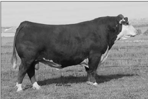
C BLACK HAWK DOWN ET