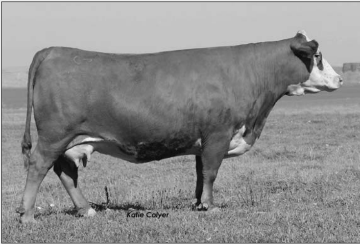
DONOR DAM ...S M326 LADY ADV 176L R98 ET