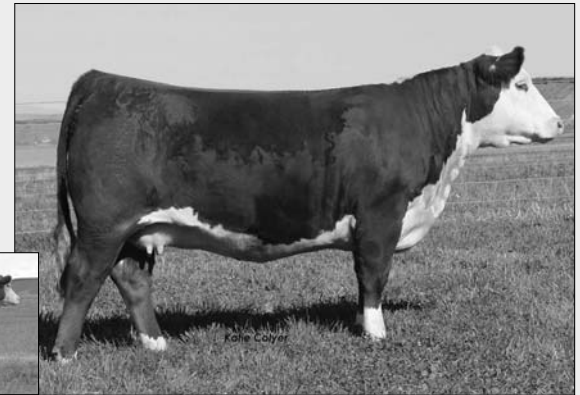
DAM OF 7242... C 95T 88X RIBEYE LADY 4208 ET

This embryo basket consists of two great donors. The 7242 cow produced a son by Validated that sold for $10,000 in 2023 and 7344 produced a son by Sancho that sold for $52,500. One of the more unique baskets you'll find but proven in what they can produce. The 7344 x Sancho embryo is conventional while the other three are IVF.