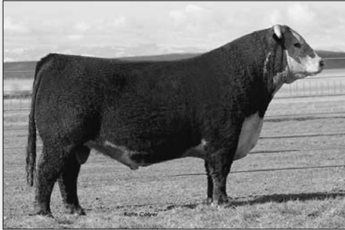
ECR 628 ADVANCE 9490 ET