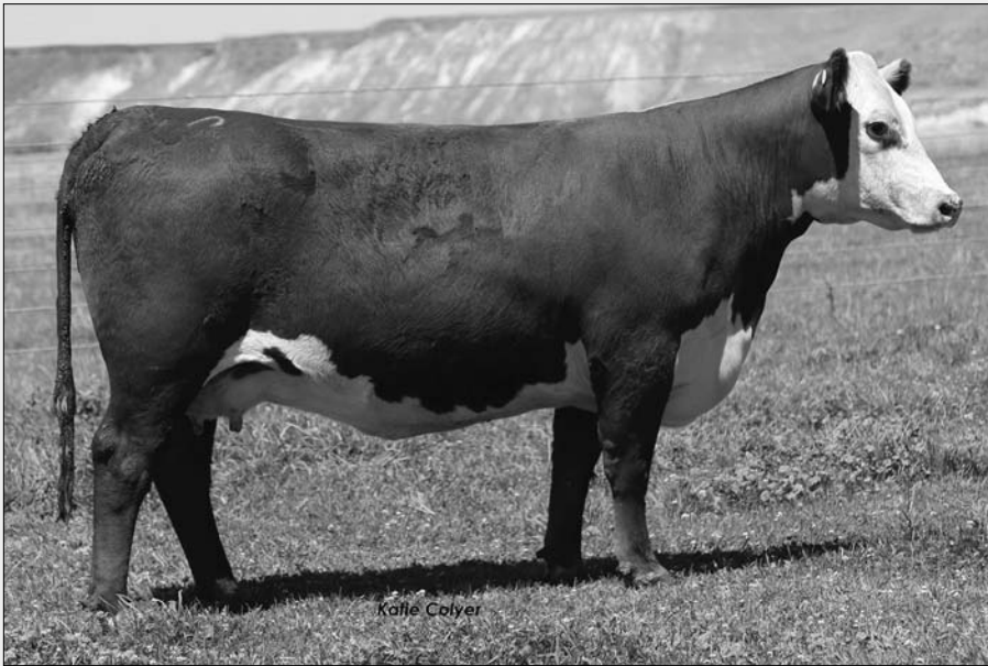
DONOR DAM ... C 8257 VALERIE 1030 ET