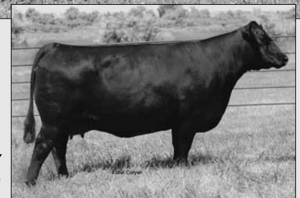
DAUGHTER ... CCC CONSENSUS EX LADY 6136