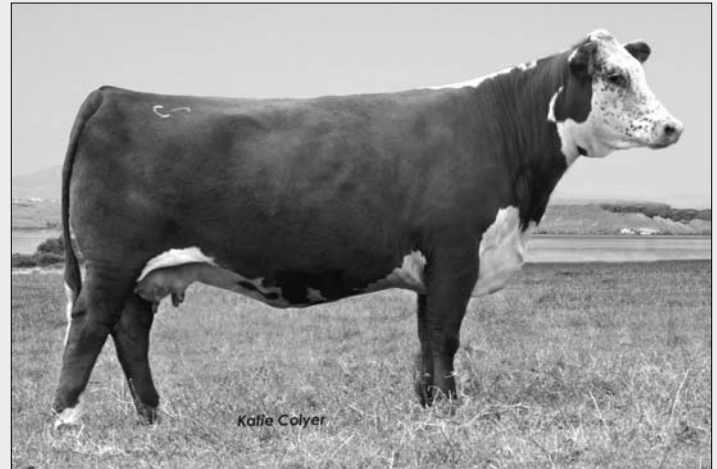
DONOR DAM ... -S LADY ADVANCE 176L R111 ET

This Foundation Female is responsible for some of the very best daughters Colyer's have in production. When you look at the impact she has made on this cowherd, you'll be hard pressed to find an equal. She possesses a great phenotype, moderate framed, has lots of rib and volume & great muscle shape. R111 has a great udder, slick fronted with lots of freckles and pigment. Her sire is one of the most highly proven sires in the breed & her dam is a foundation L1 Holden cow. Take advantage of one of the last chances to acquire outstanding maternal genetics.