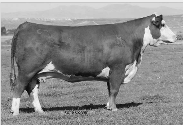
DONOR DAM ... RPH MAIDEN 95T