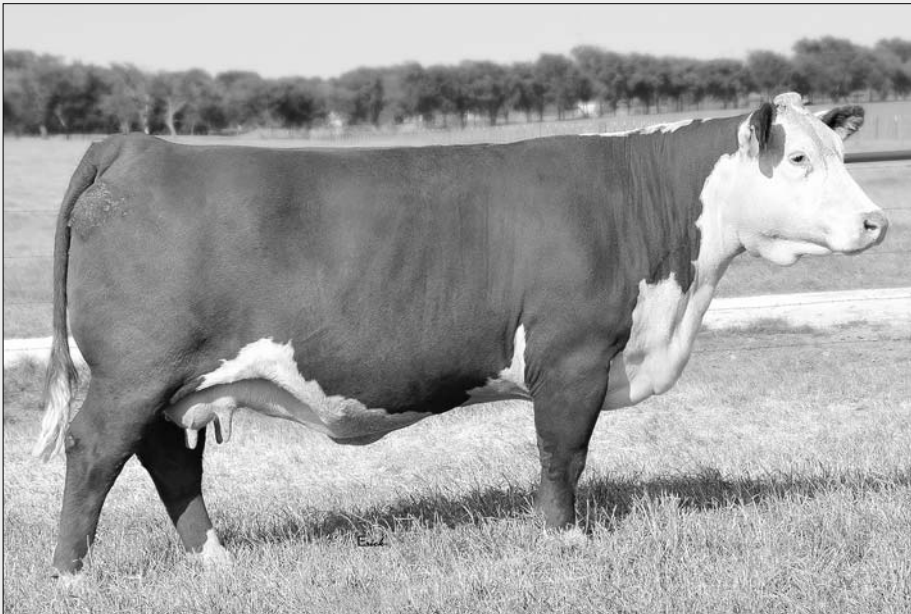
DONOR DAM ... GKB NOTICE ME TOO B954 ET