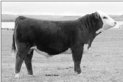
C R111 SENTINEL 2264 ET