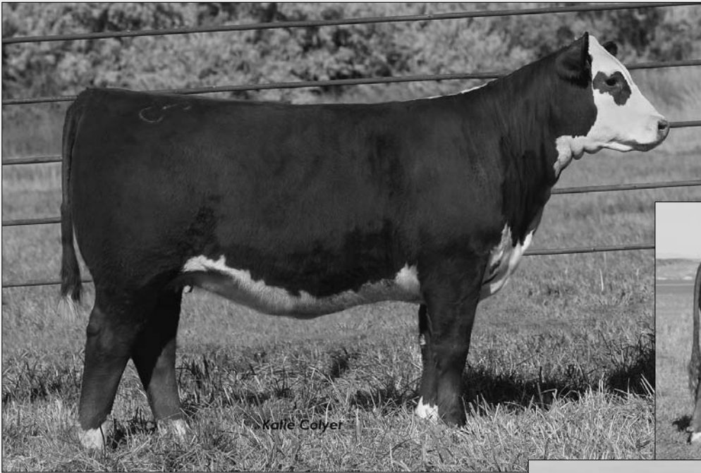
DONOR DAM ... C 1311 GENESIS GAL 2138 ET