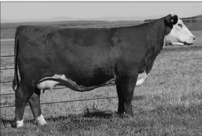
DONOR DAM ... C CLASSY DIANA 0128 ET