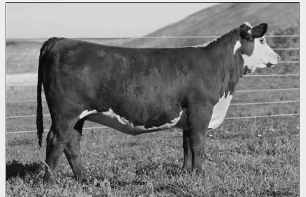
DAUGHTER ... C GUARDIAN LASS 2255 ET

DONOR DAM ... C 6078 BONNIE BELLE 9030 ET