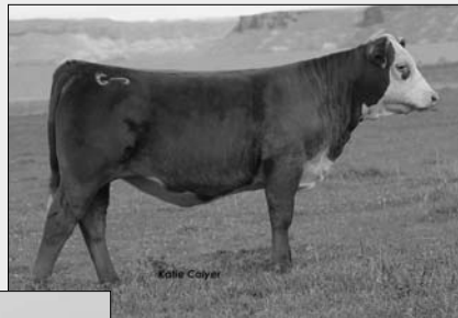
R98 DAUGHTER ... C KLC R98 LADY MILES 4095 ET