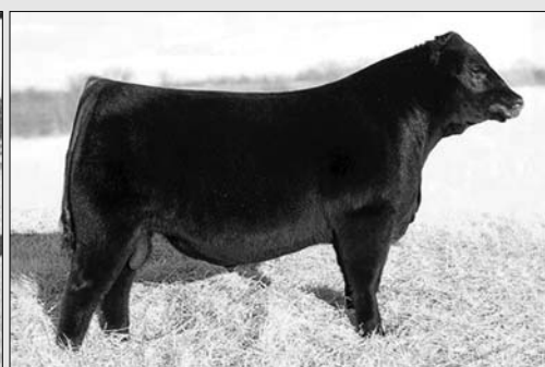
C&C MCKINLEY 3000 EXAR