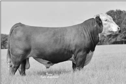
C MILES MCKEE 2103 ET