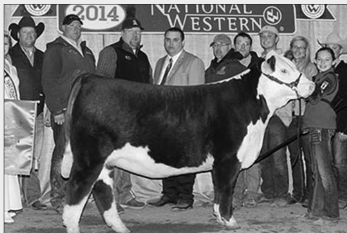
DONOR DAM ... SULL TCC MS HARLEY 322 ET