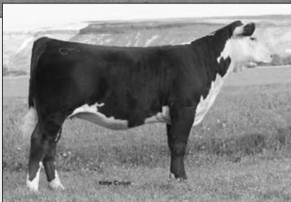
DAUGHTER ... C BAR1 CANDYLAND 7014 ET