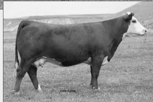
DONOR DAUGHTER ... C BLACK HAWK LASS 8013