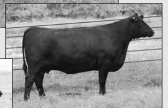
DAUGHTER ... C 8071 KNOW HOW LASS 1090 ET