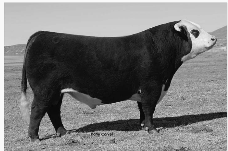
C CJC BELLE HEIR ET