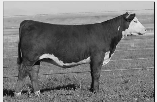
DAUGHTER ... C 1313 LADY GENESIS 2321 ET