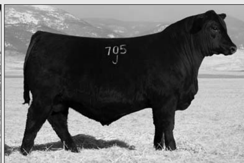
SITZ STELLAR 705J