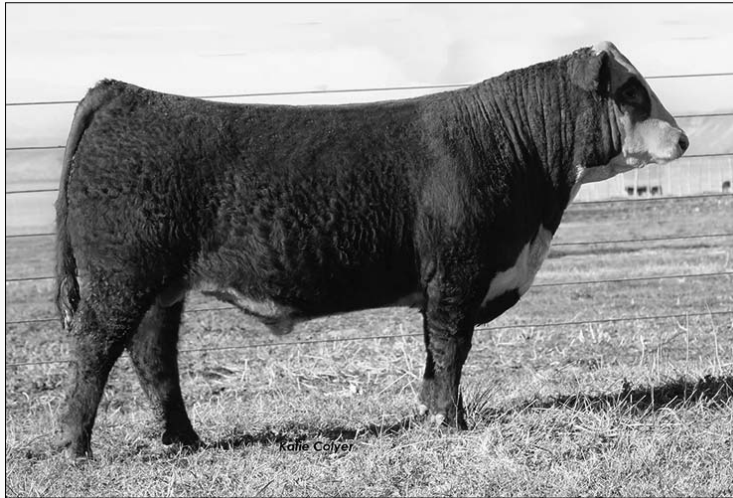
C CUDA BELLE 2111