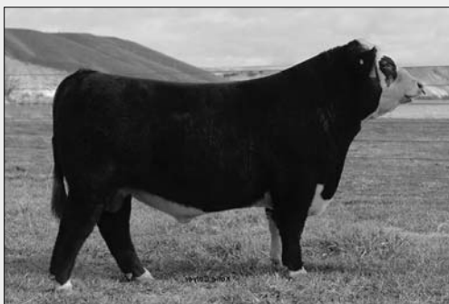
C DENALI 2105