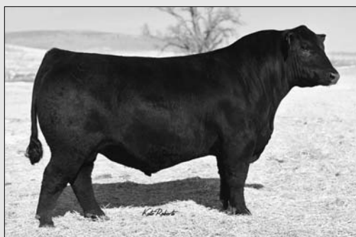
SITZ RESILIENT 10208