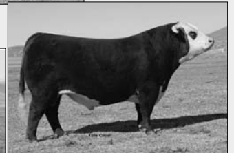
SON ... C CJC BELLE HEIR ET