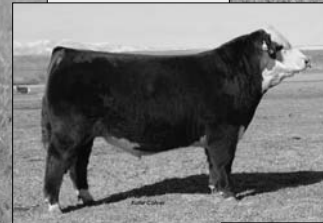
SON ... C REAL DEAL 0137 ET