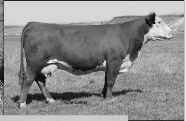
DAM ... C 88X NOTICE ME 1311 ET