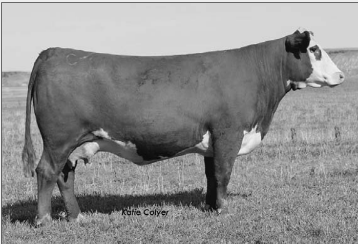
DONOR DAM ... C R98 11X KATIE 2211