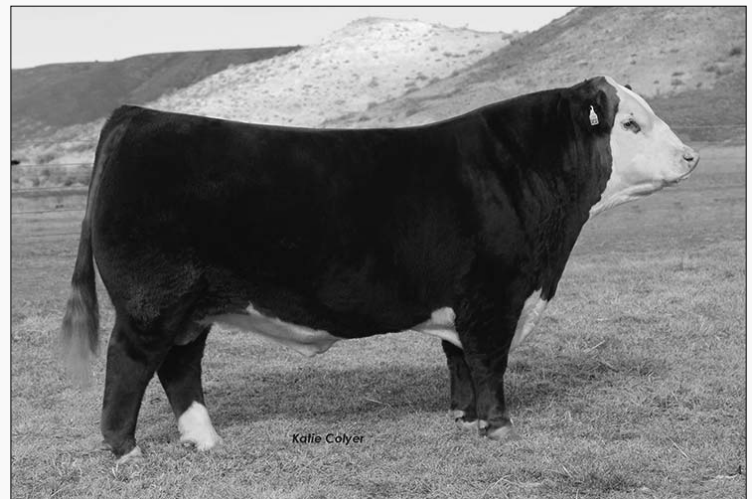
C KEY WEST 0065