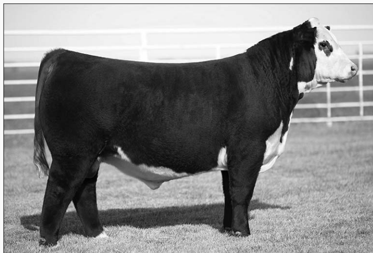
LOEWEN GENESIS G16 ET