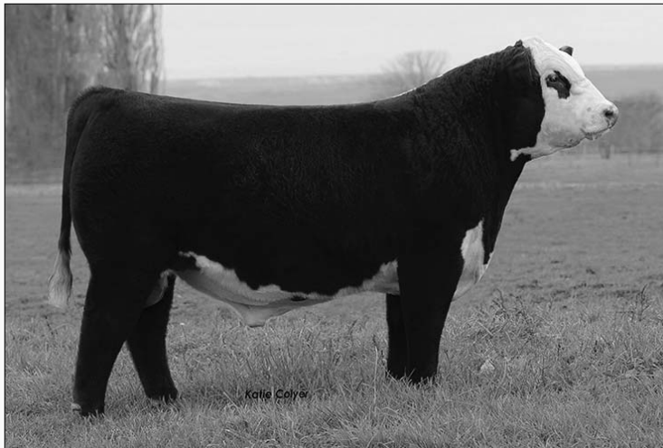
C GKB GUARDIAN 1015 ET