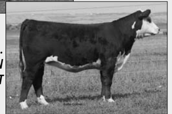
DAUGHTER ... C DOUBLE DOWN LASS 8018 ET