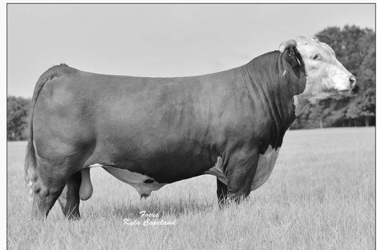
C MILES MCKEE 2103 ET