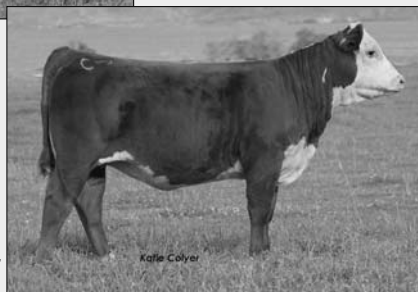
R98 DAUGHTER ... C KLC R98 MISS MILES 4100 ET