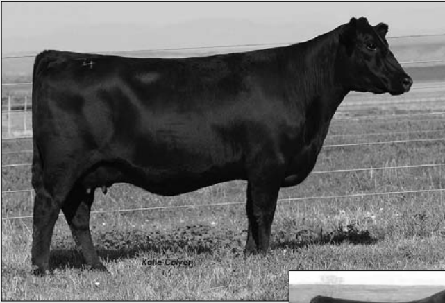
DONOR DAM ... CCC PLAYBOOK LASS 0069

FULL BROTHER TO MATING ... C 0069 WHITEWATER 3023 ET