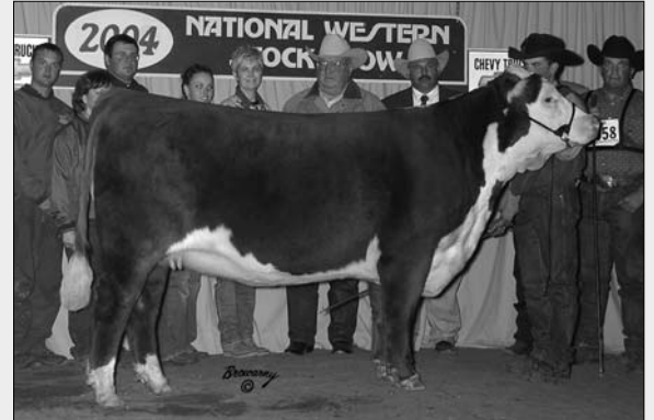
DAM ... C NOTICE ME ET