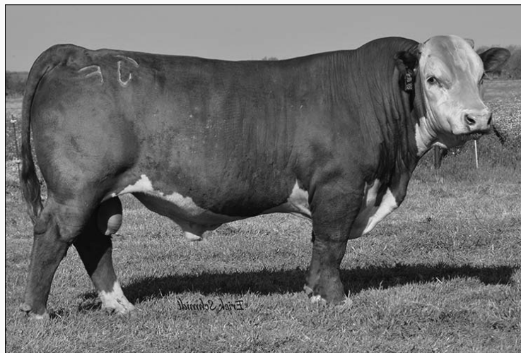
NJW 98S R117 RIBEYE 88X ET