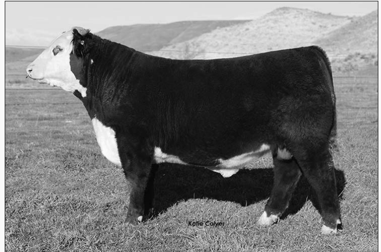
C CJC 4264 ADVANCE 3125 ET