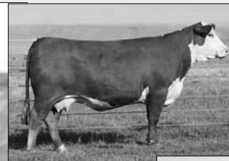
DAUGHTER ... C CJC BELLE AIR LASS 8140 ET