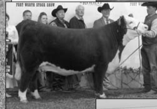
DAUGHTER ... C SNICKERS ET