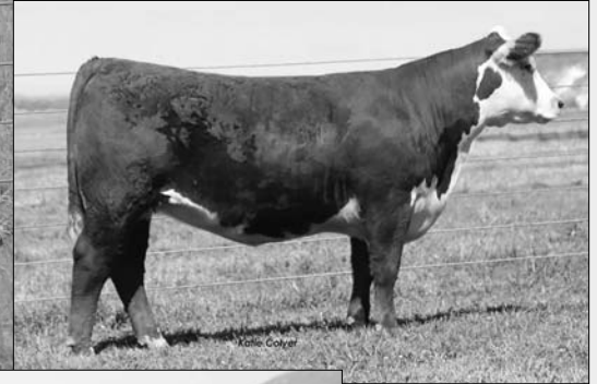
DAUGHTER ... C 6133 LADY HAWK 9216