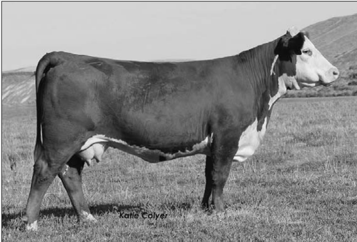
DONOR DAM ... C COTTON CANDY 3003