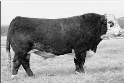
LED GKB LEGEND 108 ET