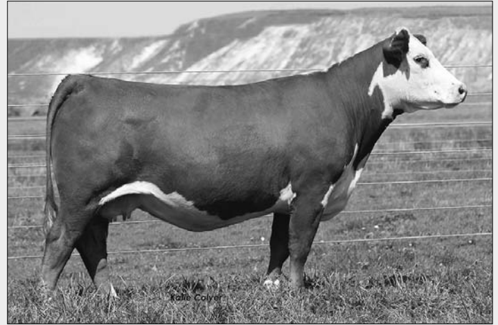
DONOR DAM ... C 2052 LADY BLACK HAWK 8336 ET