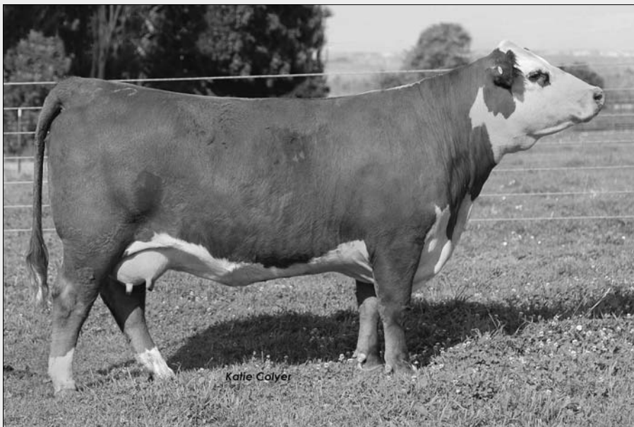
DONOR DAM ... C 8105 GENESIS GAL 1008 ET