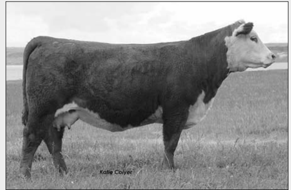
DAM OF 8078 ... C 812U MISS MILES 4196 ET