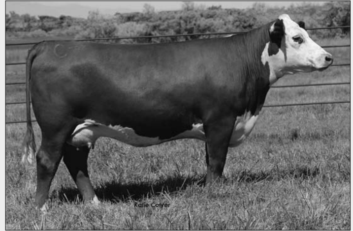
DONOR DAM ... C 6133 FRONTIER LADY 0132 ET