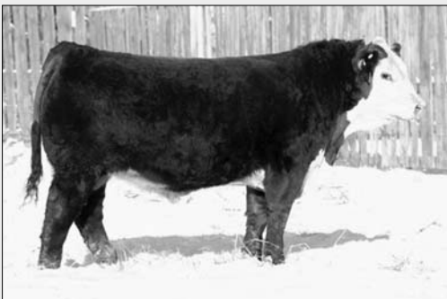
WLB WINCHESTER POWERBALL 27A