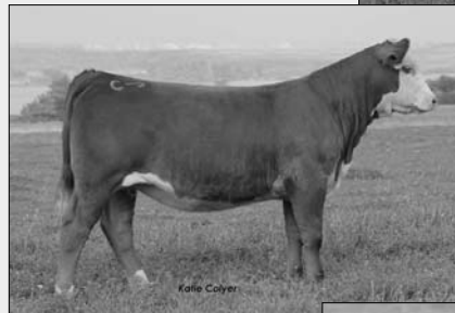
R98 DAUGHTER ... C KLC R98 MISS MILES 4028 ET