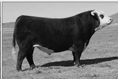
C CJC BELLE HEIR ET