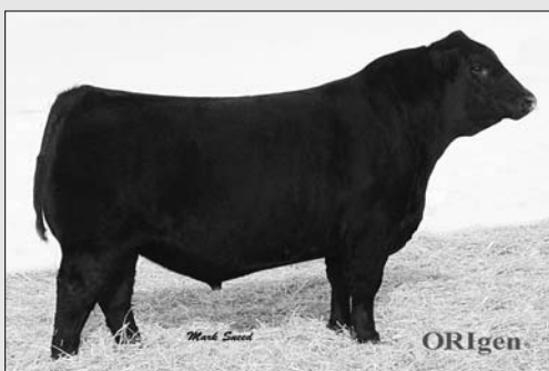
R B ACTIVE DUTY 010