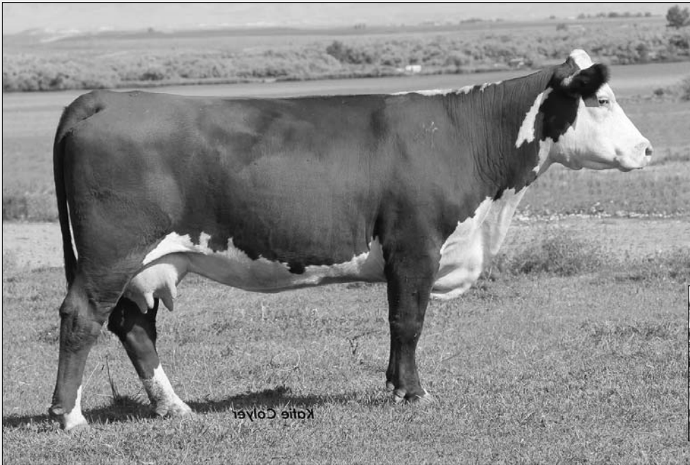
DONOR DAM ... HHR PAY IN GOLD 1008X ET