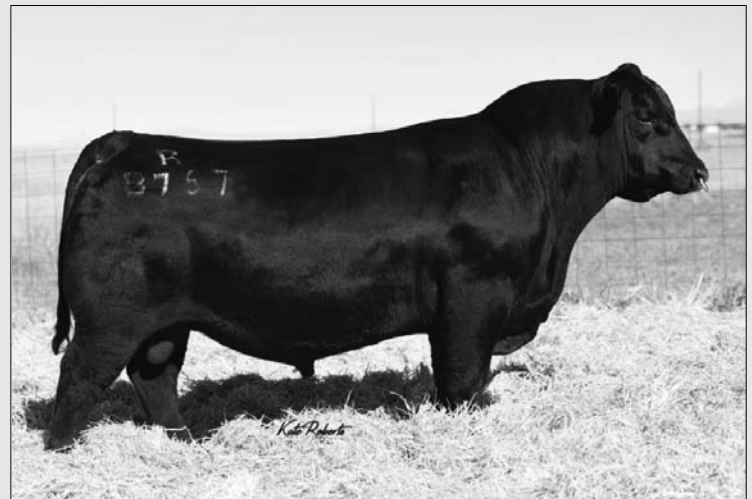
SIRE ... TEHAMA TAHOE B767