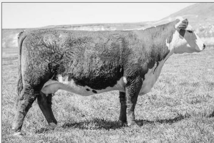
DONOR DAM ... C 4038 CANADA LASS 8257 ET