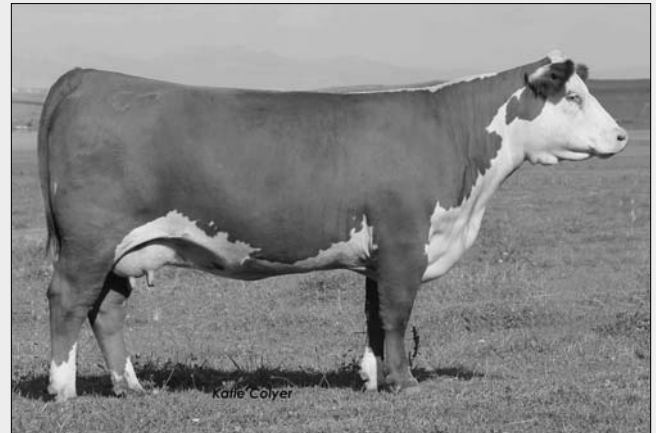
DONOR DAM ... C CJC FIREFOX 1179 ET

This New Era daughter was Colyer's first R111 donor. With an EPD profile based on high growth & carcass numbers, her daughters make excellent cows. She's posted progeny ratios of 3@103 for WW, 2@108 for REA & 2@104 for IMF. An outcross mating with the Split Butte Remedy son.