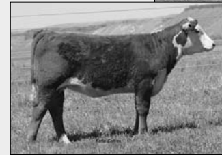
SISTER TO MATING ... C BAR1 BAILEE VALOR 9256 ET