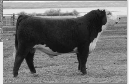
SON ... C 4038 BELLE AIR 8057 ET