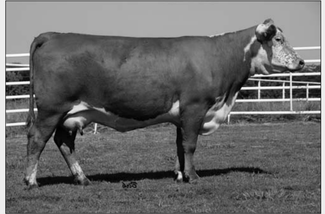
DONOR DAM ... GRANDVIEW CMR 156T LADY X325