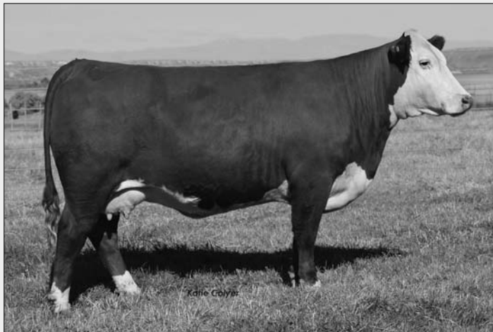
DONOR DAM ... C MILKY WAY 0061 ET