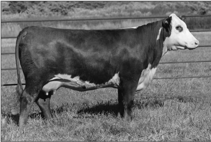
DONOR DAM ... C 6084 6011 BELLE 0190 ET