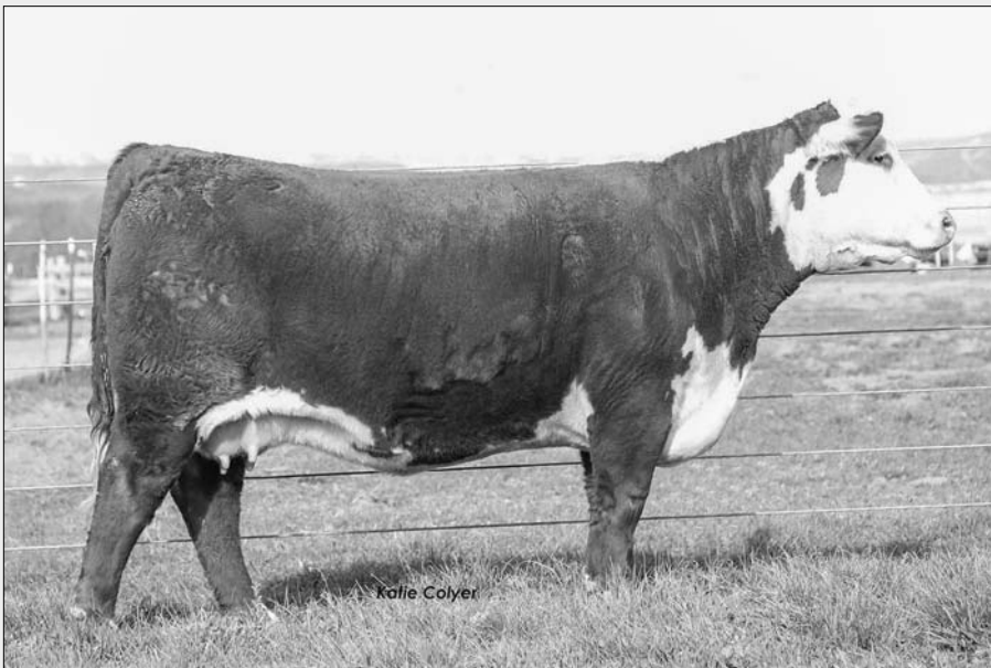
DONOR DAM ... C DOUBLE TIME LASS 8078 ET