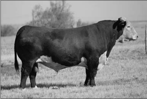
C SPECIAL EDITION 6105 ET