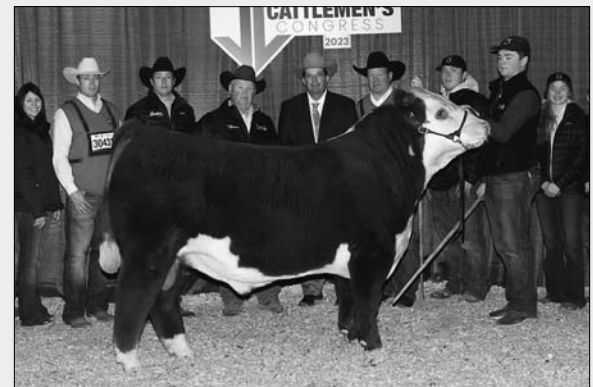
SIRE OF MATING ... BR GKB WINCHESTER 1314