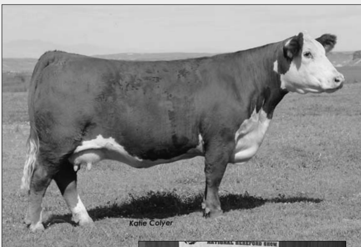
MATERNAL SISTER TO DONOR DAM ... BF 743 BURLESQUE 092X ET