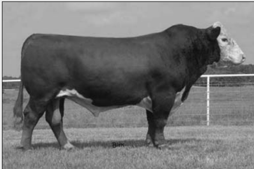
GRANDVIEW VIC H132 23G 4003 ET