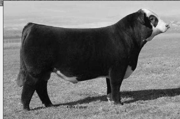
FULL BROTHER ... C CARLO 2135 ET