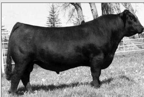
HCC WHITEWATER 9010