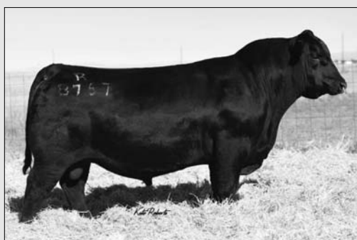
TEHAMA TAHOE B767