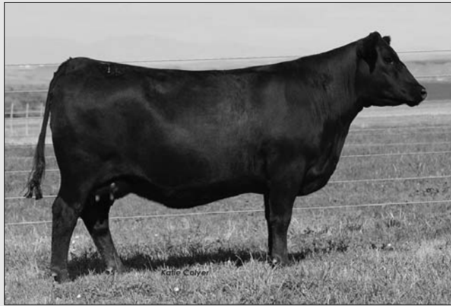
DONOR DAM ... CCC PLAYBOOK PAULA 0132