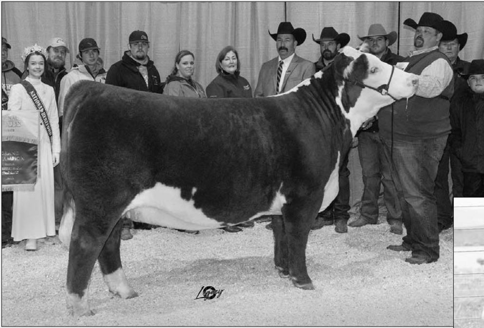
DONOR DAM ... C BAR ONE 1326 BAILEE 0226 ET