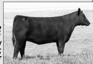
DAUGHTER ... C 8071 KNOW HOW LASS 1054 ET