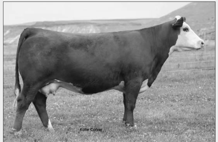
DONOR DAM ... C BLACK HAWK LASS 8013

Milky Way's first calf, she ratioed 114 at weaning time. She has gone on to become a superior calving ease & maternal female. In production, 8013 has posted a WWR of 3@106. A young donor on the forefront of her career, her progeny will be marketable for many years.... not to mention the exceptional EPD profile of this mating to Sherman.