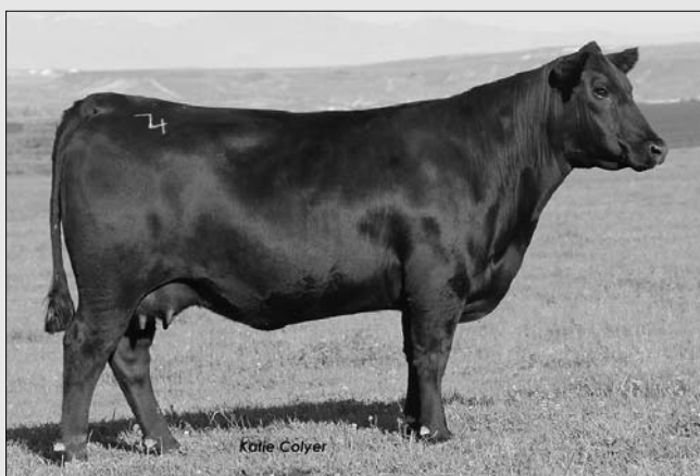
DONOR DAM ... CCC BISMARCK LADY 2010