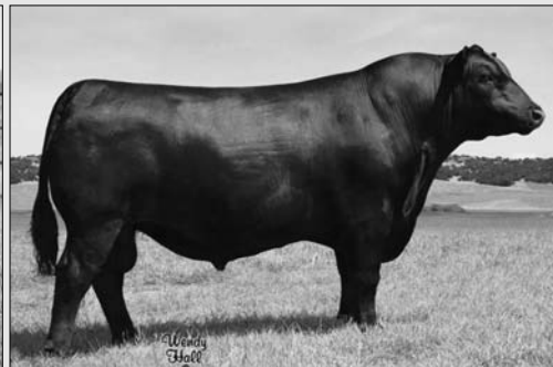
HOOVER KNOW HOW