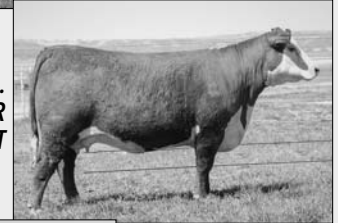
DAUGHTER ... C CJC BELLE AIR LASS 8037 ET