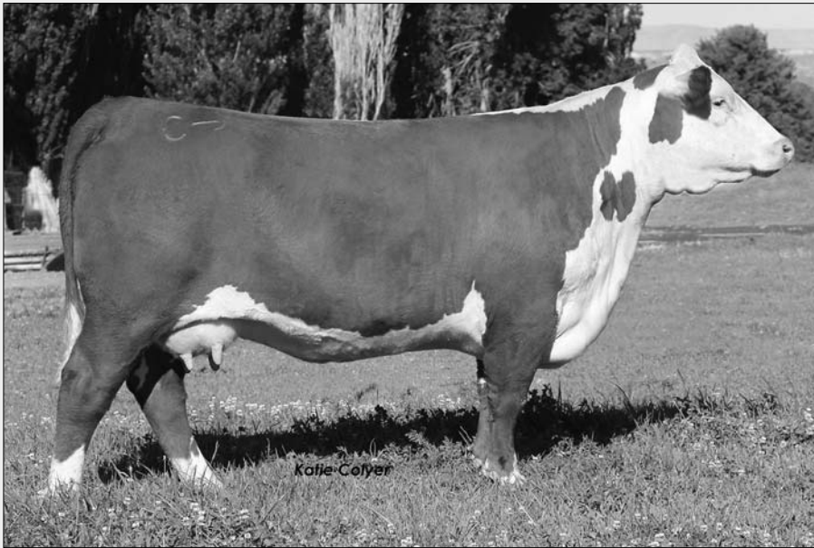
DONOR DAM ... C NOTICE ME UNTAPPED 2212 ET