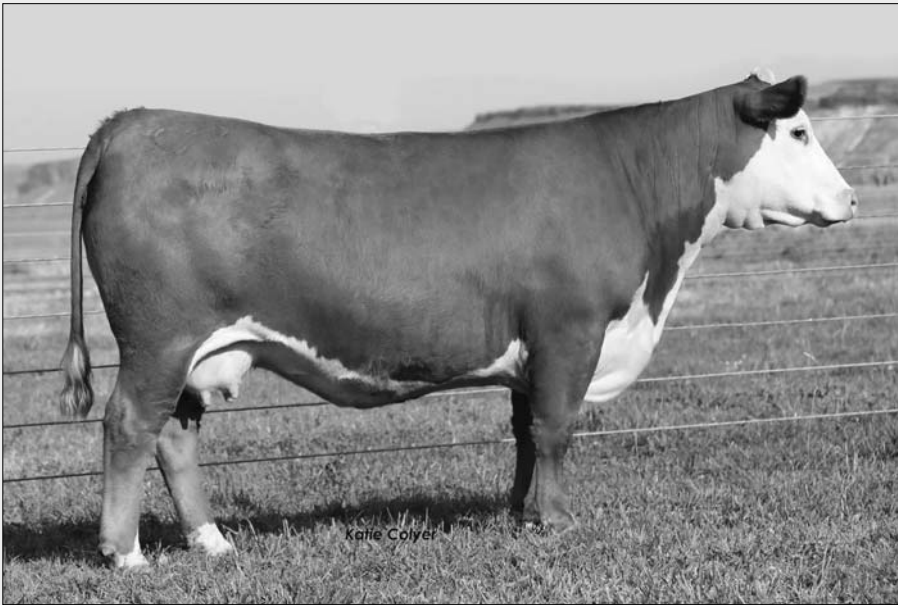
DONOR DAM ... C 2052 DOMINETTE 8204 ET