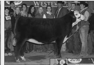
DAUGHTER ... C EYE CANDY 2079