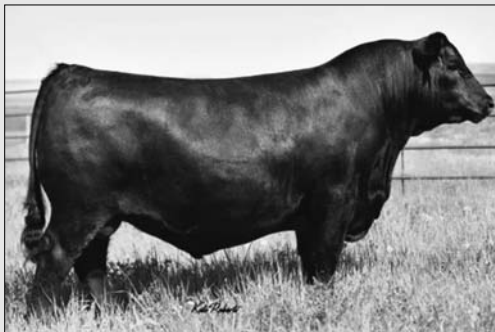
LAR MAN IN BLACK