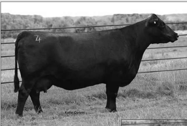
DONOR DAM ... CCC COMMANDO 7063

FULL SISTER TO MATING ... C 705J STELLAR SALLY 3147