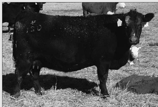
DONOR DAM ... CCC PRODUCT LADY 4021

These three embryos feature a pool of 3 different donors. The 2010 donor featured above, the Final Product daughter 4021 and the high calving ease Midland daughter. No matter what the parentage results yield, you'll have highly maternal calves with strong growth with this mating to Active Duty.