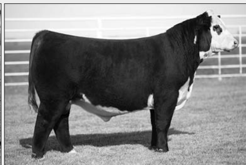
LOEWEN GENESIS G16 ET