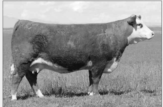
DONOR DAM ... C 88X RIBEYE LADY 2052

Very rare female due to her tremendous body depth & capacity combined with a moderate frame. 2052 is one of the tightest uddered, heaviest milking cows on the ranch. One of her recent sale features was a daughter by Black Hawk Down that sold to Bowling Ranch in 2019. A great producer, she's posted progeny ratios of 5@106 for WW, 2@103 for YW and 37@107 for IMF. The progeny from this Long Range mating will have an excellent birth – growth spread.