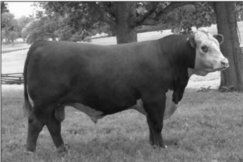
C ETF WILDCAT 4248 ET