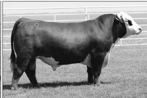
BR BELLE AIR 6011