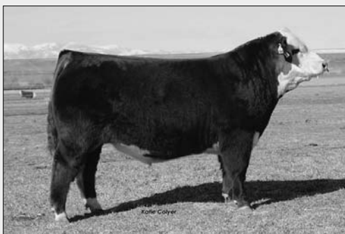
C REAL DEAL 0137 ET