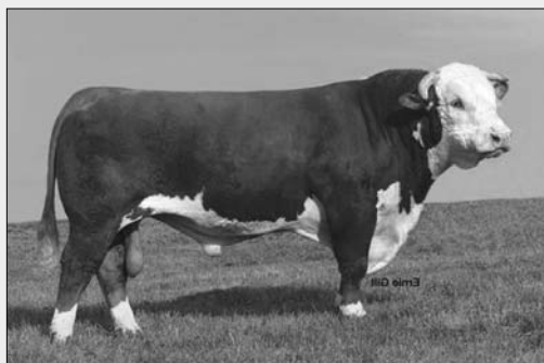
C-S PURE GOLD 98170