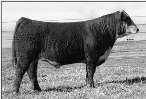
C CUDA BELLE 2111