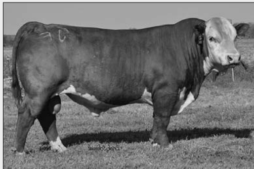
NJW 98S R117 RIBEYE 88X ET