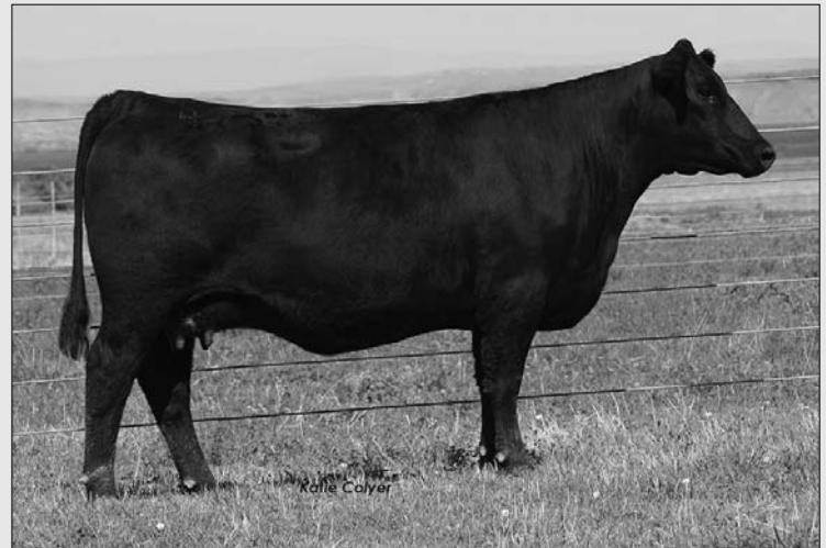
DAM ... CCC KNOW HOW HOLLY 0079

A little different package here with two great donors featured. First is the Know How daughter, 0079, out of the highly maternal Upshot dam. She possesses great look & quality to match a great spread to her production numbers and high carcass numbers with an elite $C of 330. The second donor in the package is another young female sired by Treasure and out of the Colyer 7063 donor. Both of these mated to the Stellar 705J will produce eye appealing & highly maternal progeny, and full brothers to both of these matings were features in this past Spring Bull Sale.