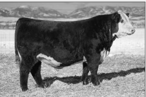
CHURCHILL W4 SHERMAN 2157K ET