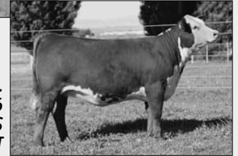
DAUGHTER ... C 8086 SANCHO LASS 2277 ET