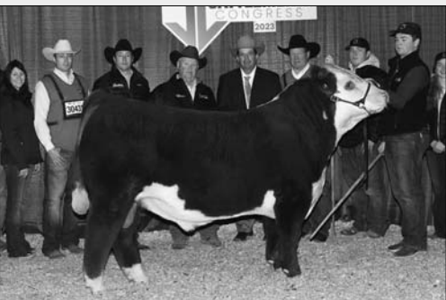
BK GKB WINCHESTER 1314