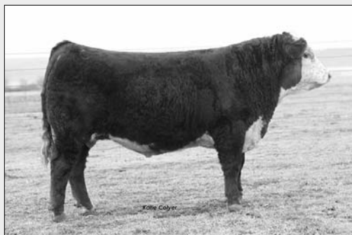
C BARRACUDA 0114 ET