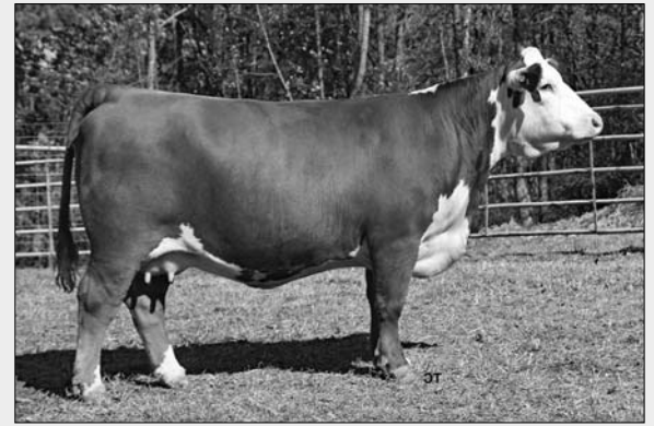
DONOR DAUGHTER ... C 6018 X651 LASS 0067 ET