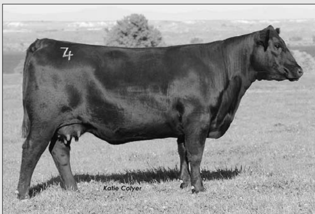
DONOR DAM ... CCC LADY BRAND 2014