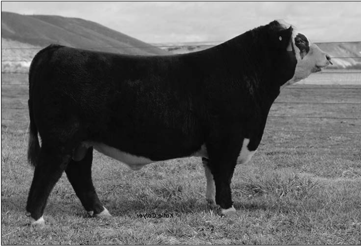
C DENALI HD 2105 ET