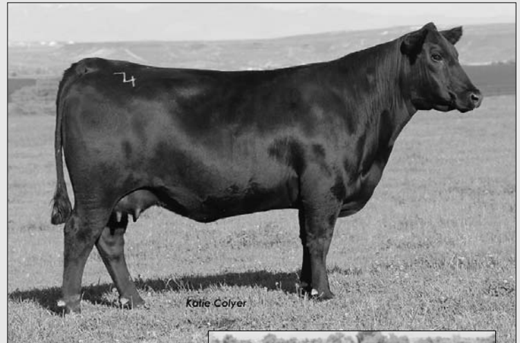
DAM ... CCC BISMARCK LADY 2010