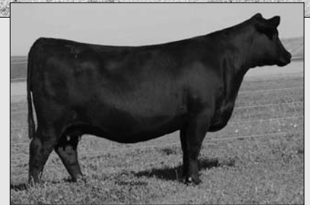
DAUGHTER ... CCC TREASURE TESS 0166