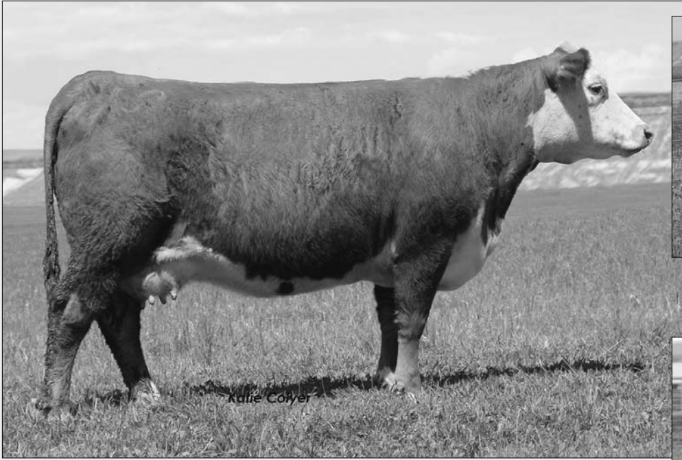
DONOR DAM ... C 105Y LADY DOMINO 4038