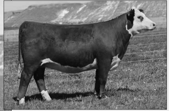
FULL SISTER ... C 4038 G16 GENESIS GAL 1005 ET