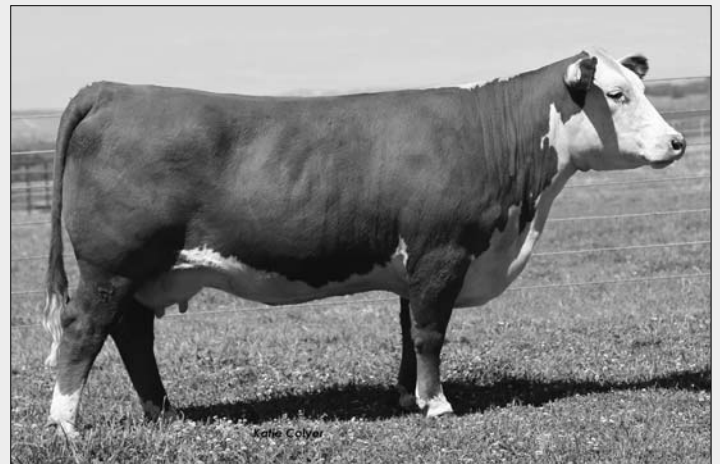
DONOR DAM ... C PURE GOLD LASS 0275