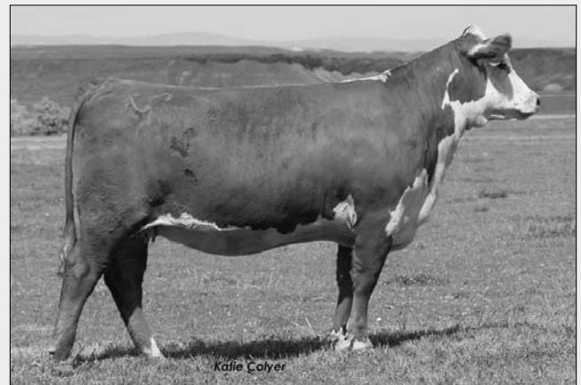
DONOR DAM ... C LADY TRUST 3021