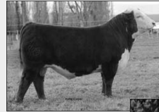
SON ... C 8086 SANCHO 1084 ET