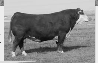
SON ... C BLACK HAWK DOWN ET