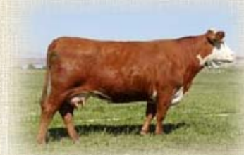
C 492D MS ADV 96007