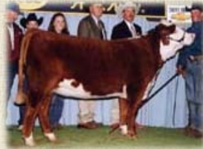
"8022" - Dam of Amber is also a choice.

Cows you can pick from include: HH Miss Advance 104A, C 492 Ms Adv 96007, C Fantasia 0040, C 572E Ms Adv 98022, the dam of Amber, 2002 Denver Reserve Grand Female, C 492D Ms Adv 97071, the dam of our February Pure Gold son in the show string. C Ms Pure Gold 0090, an impressive young cow and a full sister to C Cruiser 3148. C Miss Gold 9008, 2000 Denver Reserve Grand Champion Female. Contact us for flush terms.