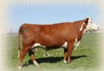
C 492D MS ADV 97071