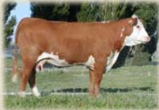
C Fantasia 0040