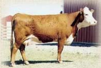
HH Miss Advance 104A

HEREFORDS Herd Bulls Females BLACK ANGUS Herd Bulls CATTLE SALES SHOW RING ABOUT US LINKS GUESTBOOK